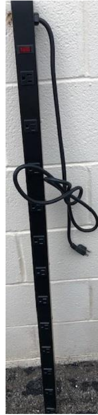
electric strips - 4