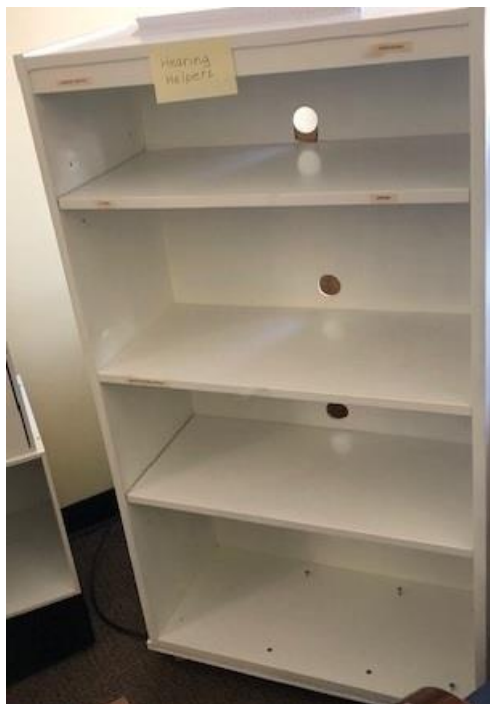
modular book case