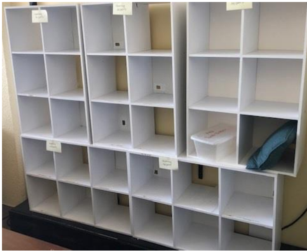
modular 6-pocket cabinets