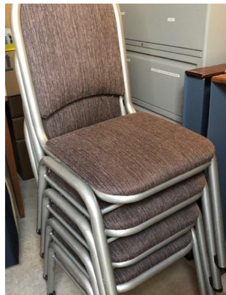
4 stackable side chairs